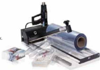
Hot Shot shown in stand & store accessory

HOTSHOT is safely stored in the same place and position, improving workflow.